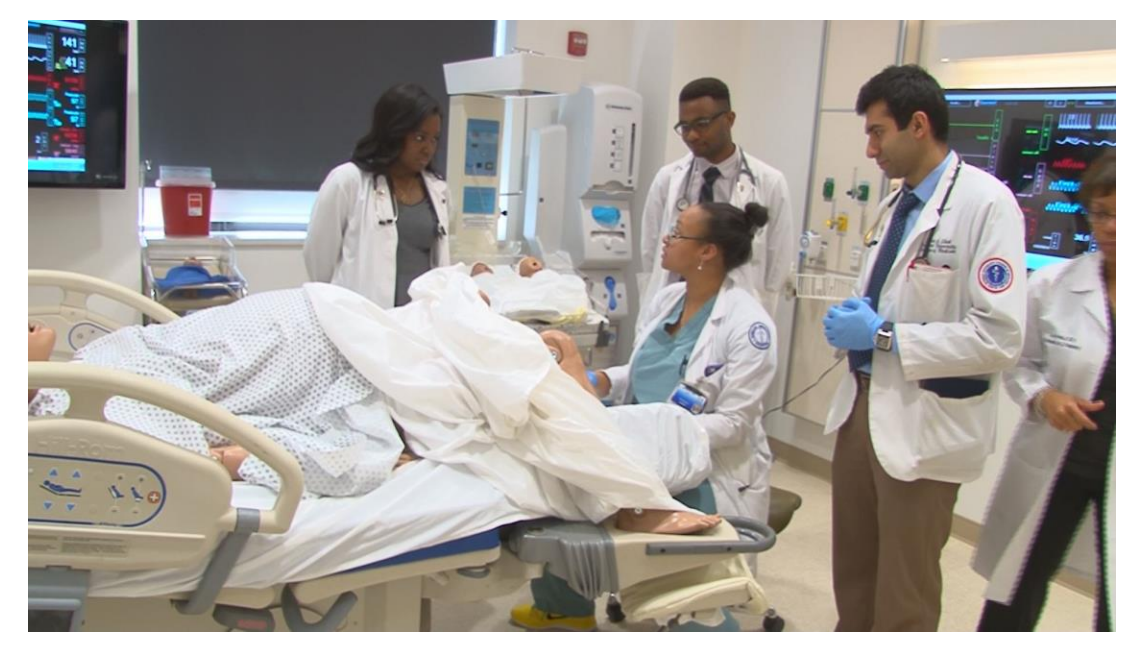
Howard unveils new medical simulation center | wusa9.com

As of today, we have obtained over $750K in grant funds for medical simulation equipment and staffing that can be used towards this facility.