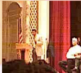
Judge Greg Mathis speaking at the Hip Hop panel

This leadership experience is one that has made voting a real issue for me, and I have committed myself to getting involved at a higher level in student government. I now serve as the Caswell Representative in Student Government.