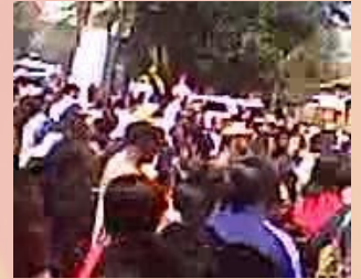
People standing at Brown Chapel AME Church before marching to the Edmund Pettus Bridge

Before this trip to Selma, I did not care a lot about voting, but while in Selma, I really got a chance to see the true meaning behind the importance of voting, and it changed my life. My perspective changed how I started to see things. Now, I know that if I do not