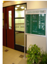
Entrance of the new Gordon P. Allen Learning Resources

The new building will provide more space, more computers, and more services. The LRC staff believes that the College community will enjoy the new LRC facility. Our new services include a Business Center,